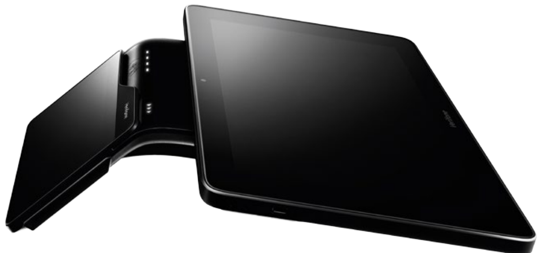
Figure 1. Verifone Carbon PoS Solution

This integrated, flexible POS platform goes beyond payment processing to help small and mid-sized merchants manage customer loyalty programs, inventory, employees, and much more. Unlike most similar solutions, Verifone Carbon has both merchant and consumer-facing screens. It comes loaded with Verifone's Commerce Platform, an open, cloud-based platform where businesses can customize applications and services. For example, retailers can run a customer relationship management (CRM) application, display promotional materials, and allow customers to redeem personalized offers in real time.