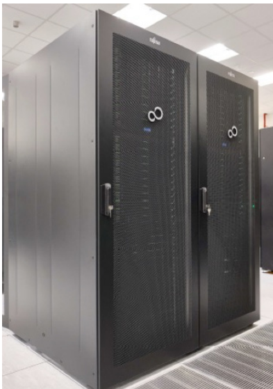
Intel Optane DC persistent memory along with 2nd Generation Intel Xeon Scalable processors deliver a flexible B-APM architecture for servers.