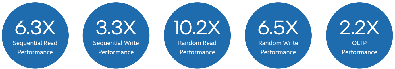
Figure 3: Comparison of “Base” and “Plus” Performance

The “Plus” configuration utilizes the App Direct Mode of Intel Optane persistent memory to provide a larger memory pool and a high-speed cache to reduce solution latency. Test data shows that the IOPS of the “Plus” configuration is superior in both sequential and random read/write requests 3 .