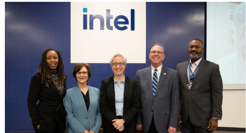
In April 2024, we welcomed Oregon elected officials and community leaders to our site to celebrate the US Department of Commerce's $8.5 billion in direct funding to Intel under the CHIPS and Science Act.

Intel's spending with Oregon-based diverse suppliers in 2023