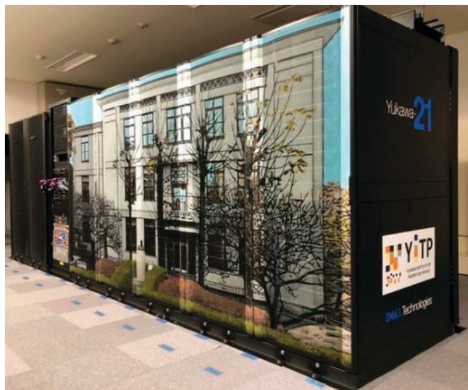
The Yukawa-21 system features Dell EMC PowerEdge R840 platforms with 28-core Intel Xeon Platinum 8280 processors.

To assess the performance of the design, scientists prepared benchmark programs. Three benchmark applications developed by physics researchers provided simulation codes for nuclear structure, the structure of the universe, and quantum spin systems. Three other more general benchmarks included the High Performance Conjugate Gradients (HPCG), Interleaved or Random (IOR), and STREAM OpenMP.